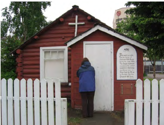
The Berg-Brown Cabin (430 E. 4 th Ave.) was listed on AAHP's 2012 10 Most Endangered Properties list