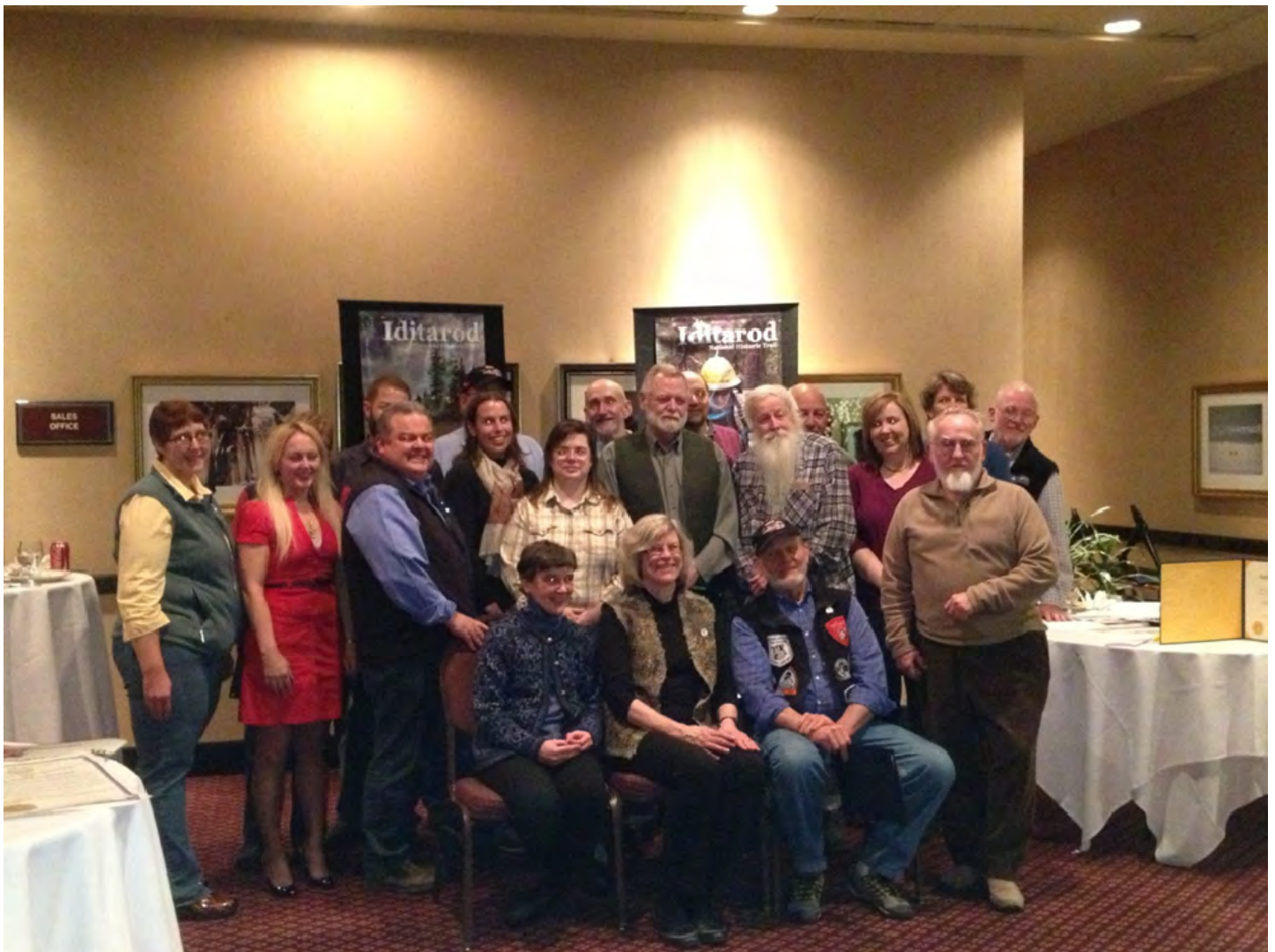
Recipients of the U.S. Department of Interior 2012 Partners in Conservation Award for the Iditarod National Historic Trail Centennial Project, at a reception in their honor held November 29, 2012.

The Iditarod National Historic Trail Centennial Partnership led by Iditarod Historic Trail Alliance (IHTA), an AAHP partner, was one of 17 organizations honored with a 2012 Partners in Conservation award by the U.S. Department of the Interior.