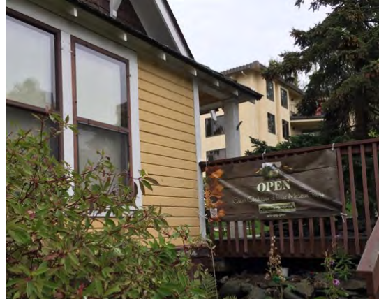
Handsome signs provided by the Municipality of Anchorage told potential visitors that the House Museum was open for tours.

Please note that your AAHP membership entitles you to free admission to the Oscar Anderson House Museum during the summer season. The Museum is open for guided tours starting the day after Memorial Day and running through the Friday before Labor Day.