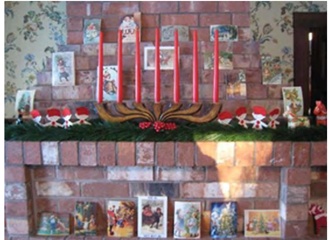
Tomtens and Dala horses peek out from among the other decorations to greet visitors during Swedish Holidays at the Oscar Anderson House Museum.

Swedish-style treats of the season and traditional activities will also be shared with visitors. A special activity will take place on Sunday, December 13, which is St. Lucia Day. Each year, this festival of light is traditionally observed in Sweden and other countries, with a focus on hospitality, sharing, and caring for others. Young girls dress as St. Lucia in a white dress with red sash and a wreath of candles on her head. St. Lucia may be attended by Star Boy.