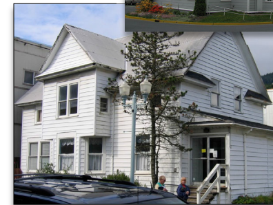
Ten Most Endangered Historic Properties since 1991